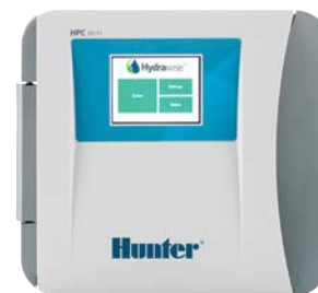
HPC Face Panel

HPC (indoor/outdoor) Height: 9" Width: 10" Depth: 4½"