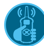
ROAM Remote ROAM XL Remote